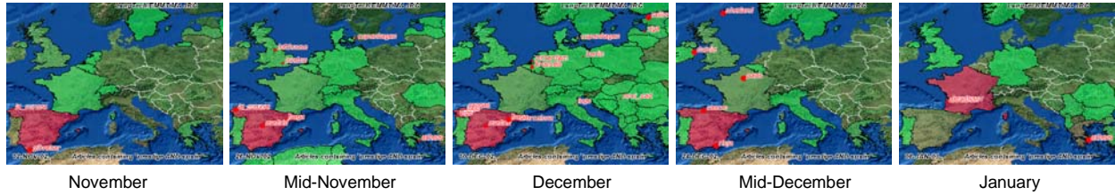
Figure 6: Animation example: “Prestige” tanker accident in Spain (11/2002). The geographical news coverage shows that the oil moved towards the coast of France in January 2003.