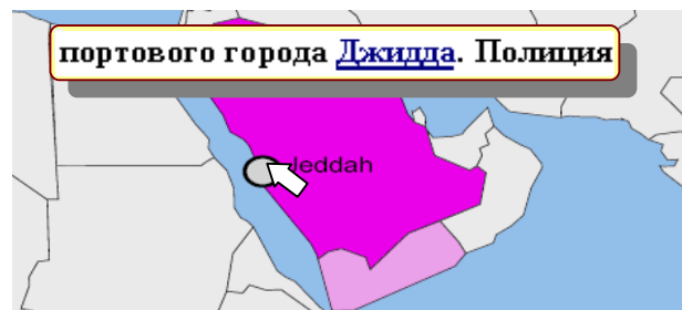
Figure 5: Example of an interactive map, using SVG.