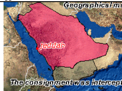
Figure 4: A short text including geographical information and two different visualisations produced with DMA.

The consignment was intercepted last month on a desert road near the port city of Jeddah . Police say the weapons - capable of being used to bring down aircraft - had been smuggled from Yemen .