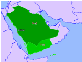
Figure 3: Map of Saudi Arabia (2 hits) and Yemen (1 hit), generated on the basis of shape files .

The main disadvantages are that the implementation work is tedious and that the generation of maps is slow and computationally heavy when the polygon generation is not optimised. It requires a shape file for each country. The main advantage is its independence from commercial software.